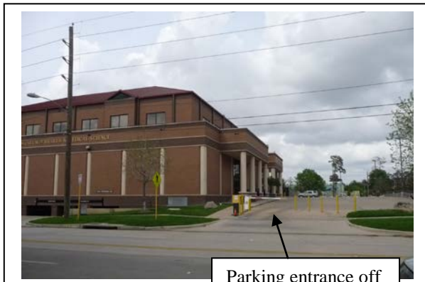
Parking entrance off of Hermann Drive